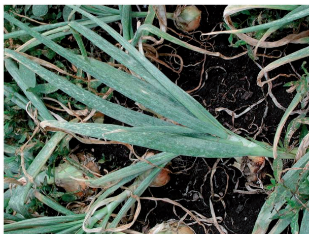
Fig. 3. Feeding damage caused by onion thrips, T. tabaci .