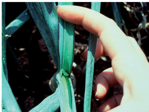
Fig. 7. Onion thrips, T. tabaci, are easier to observe and count after opening the neck of an onion plant.

The use of insecticides is the most common management tactic for onion thrips infestations in commercial onion production. Host plant