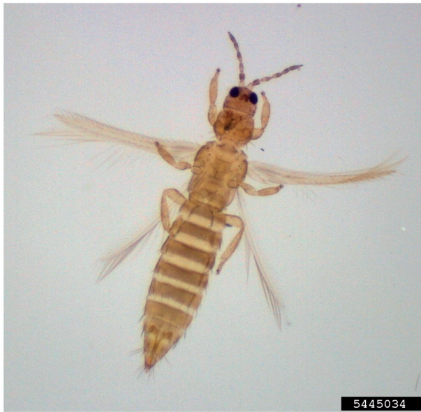
Fig. 1. Adult onion thrips, T. tabaci .