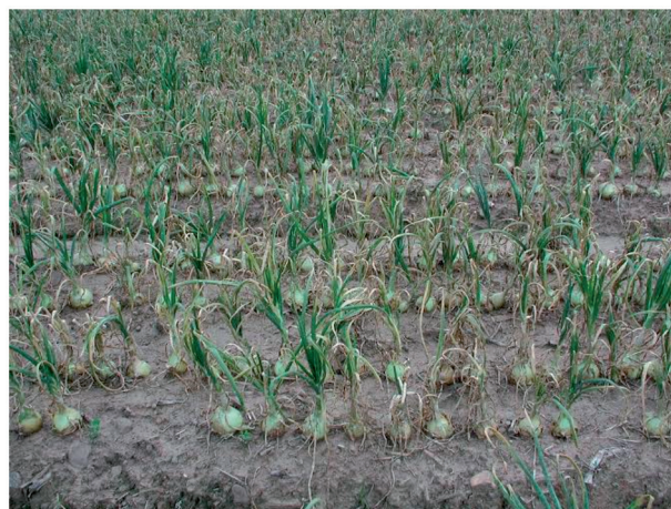
Fig. 6. Onions damaged by Iris yellow spot virus in a field in western New York.

nor is it successfully transmitted mechanically (Gent et al. 2006). First instars can acquire the virus from an infected plant and the acquisition rate decreases as the larva matures. Once acquired, tospoviruses can be propagated in the vector's body and transmitted in a persistent and circulative manner (Ullman et al. 1992, Wijkamp et al. 1993). Viruliferous adult thrips are capable of transmitting IYSV for life.