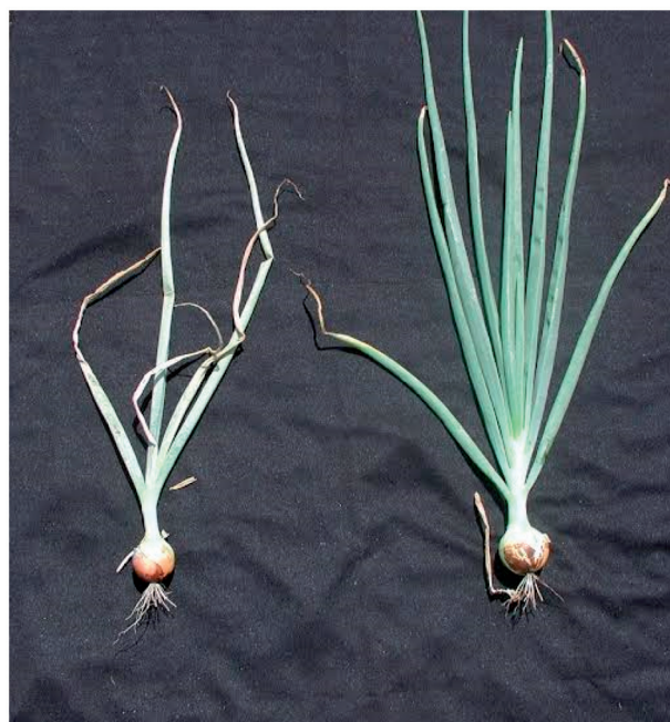
Fig. 5. Onion thrips, T. tabaci , damaged onion plant (left) compared with a nondamaged onion plant (right).

Pathogen Transmission. Thrips are the only vectors of tospoviruses and onion thrips is the principal vector of the tospovirus IYSV in onion (Kritzman et al. 2001). The tobacco thrips, Frankliniella fusca (Hinds), also may transmit IYSV, but transmission only has been shown to lisianthus, Eustoma russellianum (Salisbury), and not onion (Srinivasan et al. 2012). IYSV was first detected in Idaho in 1989, and by 2000 it was confirmed in most onion-producing areas in the United States and Canada. IYSV is not transmitted via onion seeds (Gent et al. 2004),