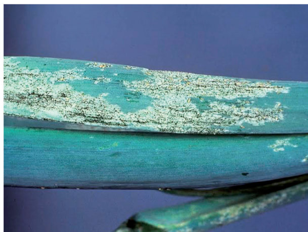
Fig. 4. Feeding damage caused by onion thrips, T. tabaci .

reduced photosynthetic efficiency (Boateng et al. 2014). Damage appears as silvery patches or streaks on the leaves (Rueda and Shelton 1995; Figs. 3–5). Severe feeding injury by onion thrips is also associated with tiny black “tar” spots, which is excrement from thrips (Fig. 4; Cranshaw 2004). Feeding on leaves also can create an entry point for plant pathogens (Orloff et al. 2008).